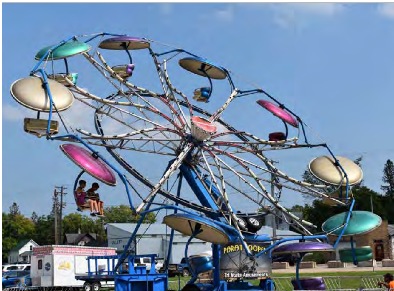
The Paratrooper ride is among the attractions that Tri-State Amusements is again bringing to the Oconto County Youth Fair.